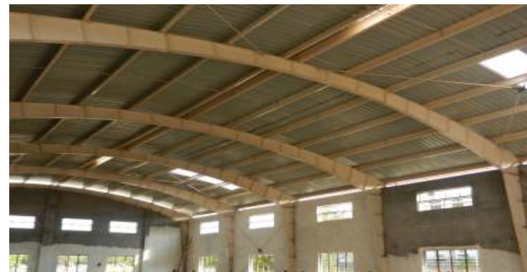
PEB Auditorium (Arch Type)