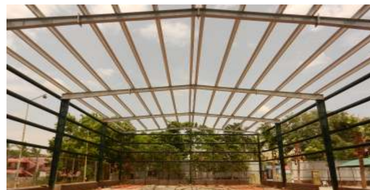
PEB Auditorium (A -Type)