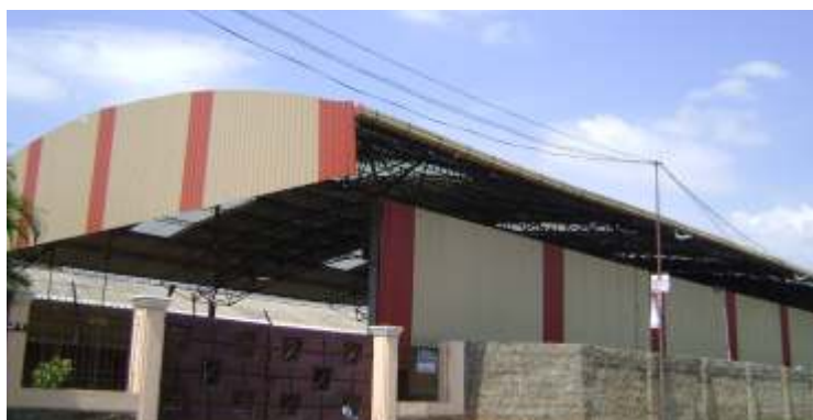
Open Auditorium with Cladding