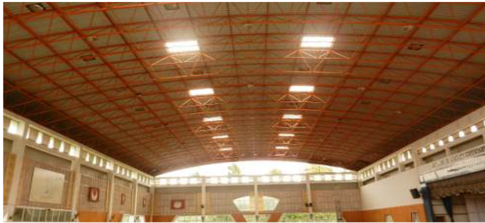
Closed Auditorium cum Indoor Stadium