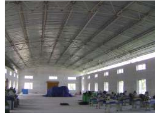
WORKSHOP SHED / CANTEEN ROOF