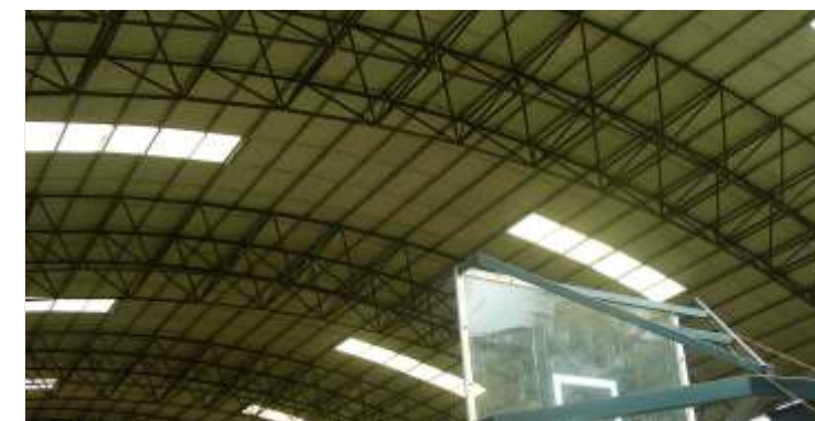
Auditorium cum Indoor Stadium