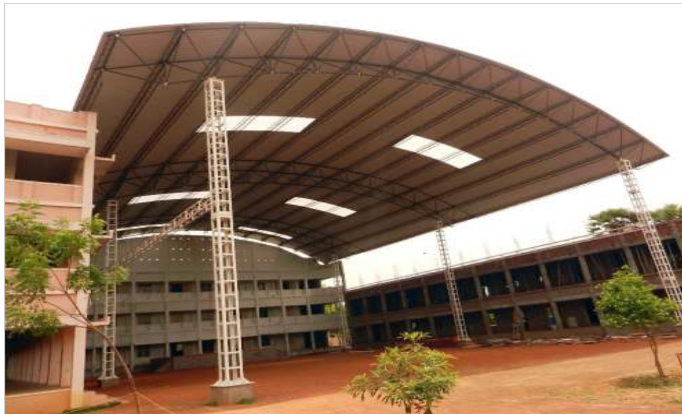
Open Auditorium cum Bus Park Shed